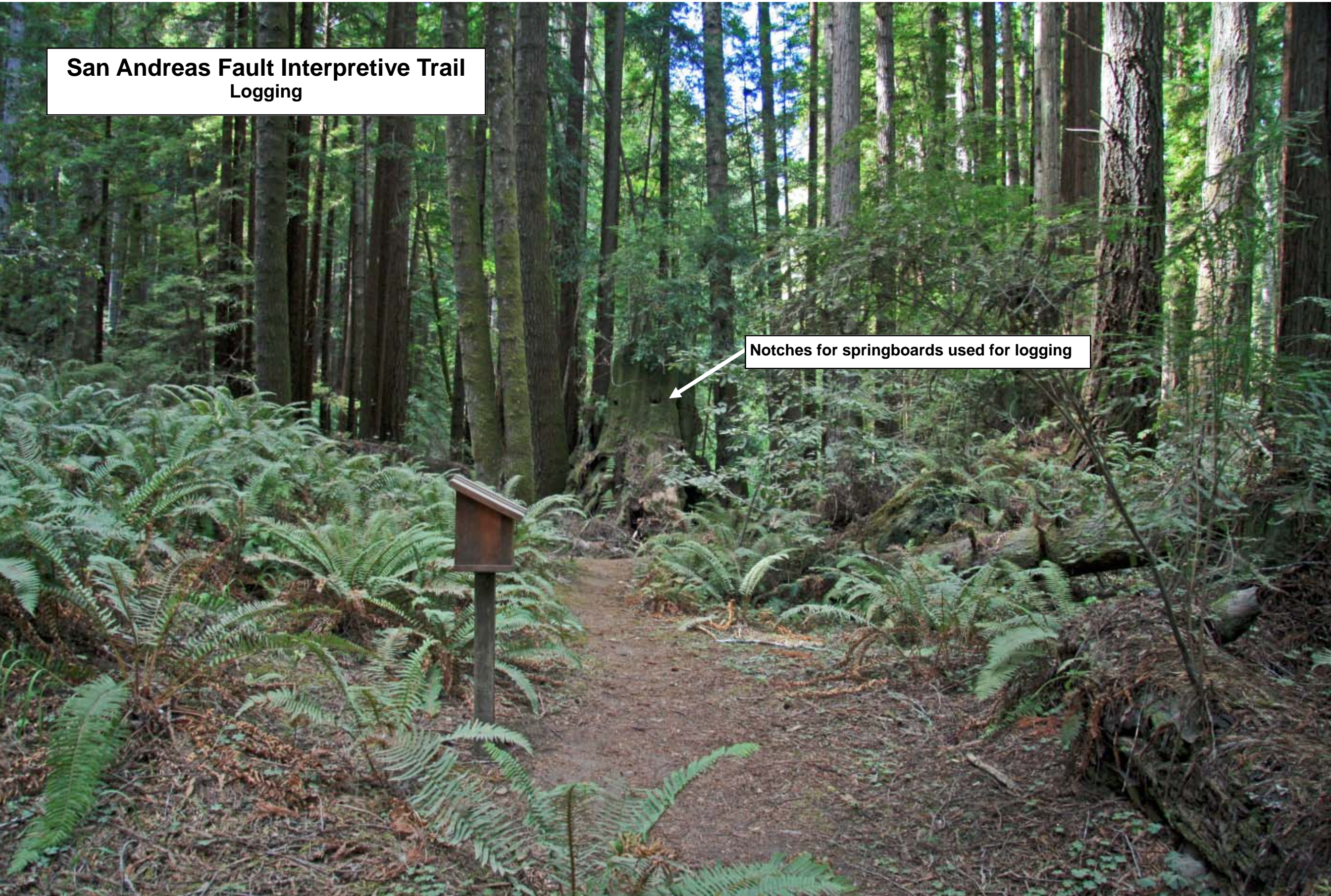
Photo: Pamphlet Box near trailhead Trail guides are available at the pamphlet box near the trailhead. Redwood forest, logged, scars of logging

Notches for springboards used for logging