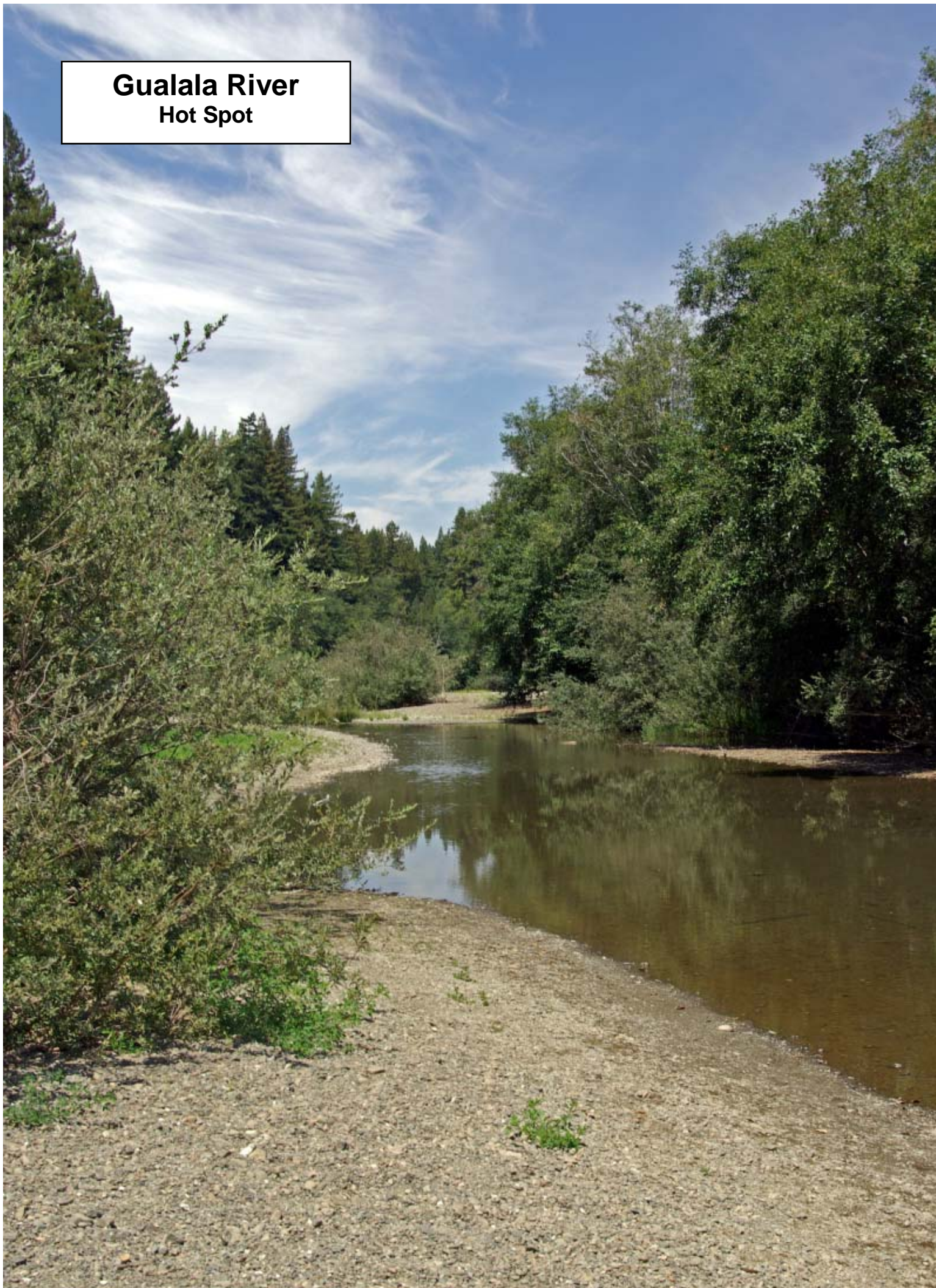
Photo: Looking northwest down the Gualala River from the Hot Spot

The Hot Spot is on the Gualala River and is a popular destination for summer swimming when the river is slow and the water is warm. The Hot Spot lies within the San Andreas Fault zone, and a visit to the Hot Spot provides a good opportunity to see some of the features of the San Andreas Fault.