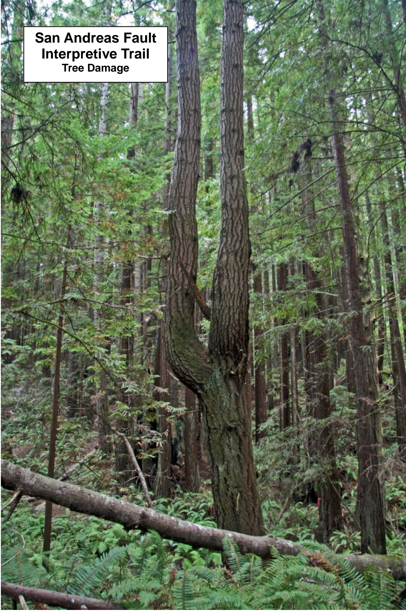
Photo: Double Trunk

During the 1906 earthquake a number of trees were damaged by the severe shaking, either breaking off the top or splitting the trunk, When this happens, a double trunk often develops above the damaged area.