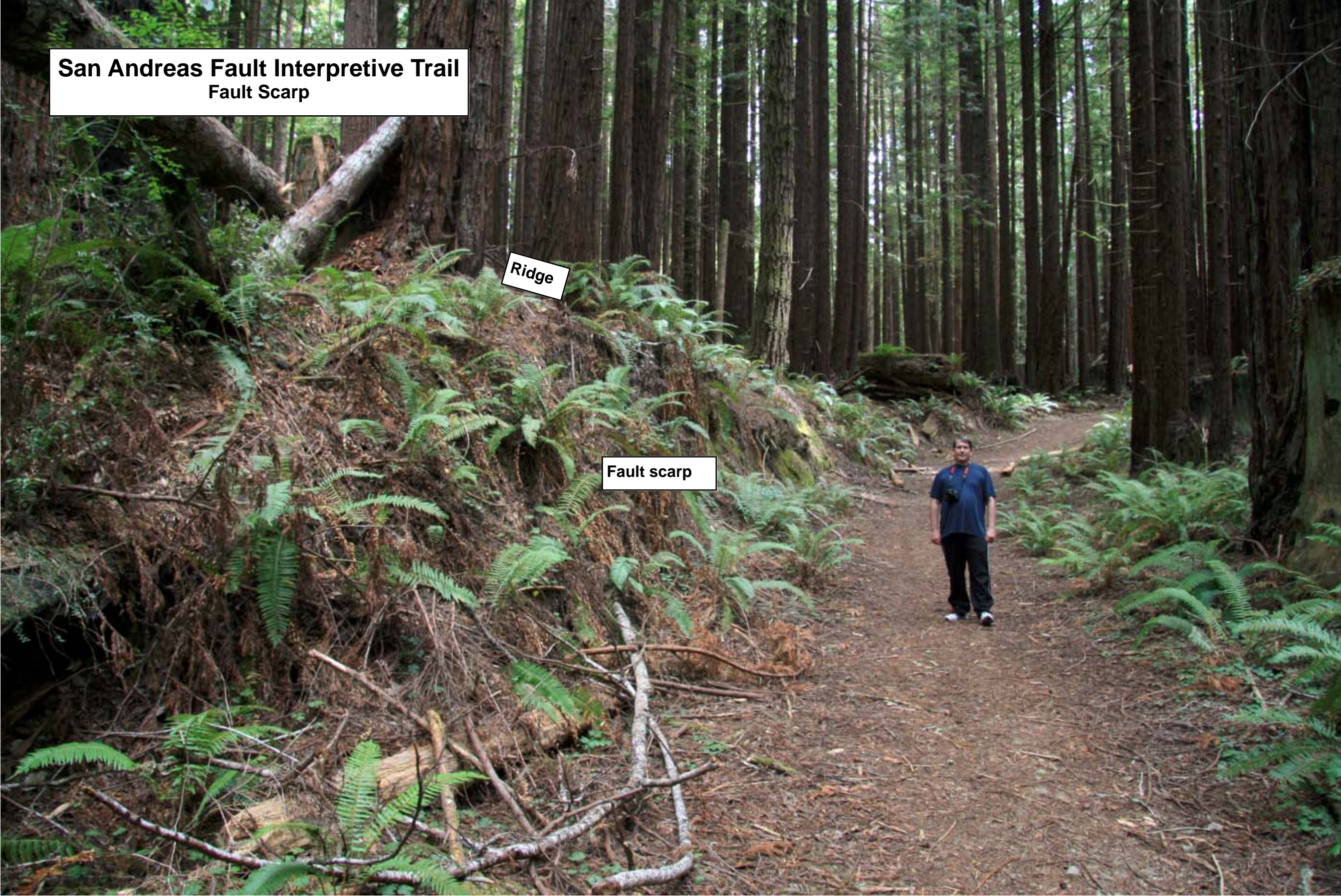
Photo: Looking southeast along Hot Spot Loop Trail

The end of the San Andreas Fault Interpretive Trail connects to the Hot Spot Loop Trail and the loop trail returns to River Beach Road. On the return trip, you pass a fault scarp that formed during uplift of the ridge on the left side of the photograph.