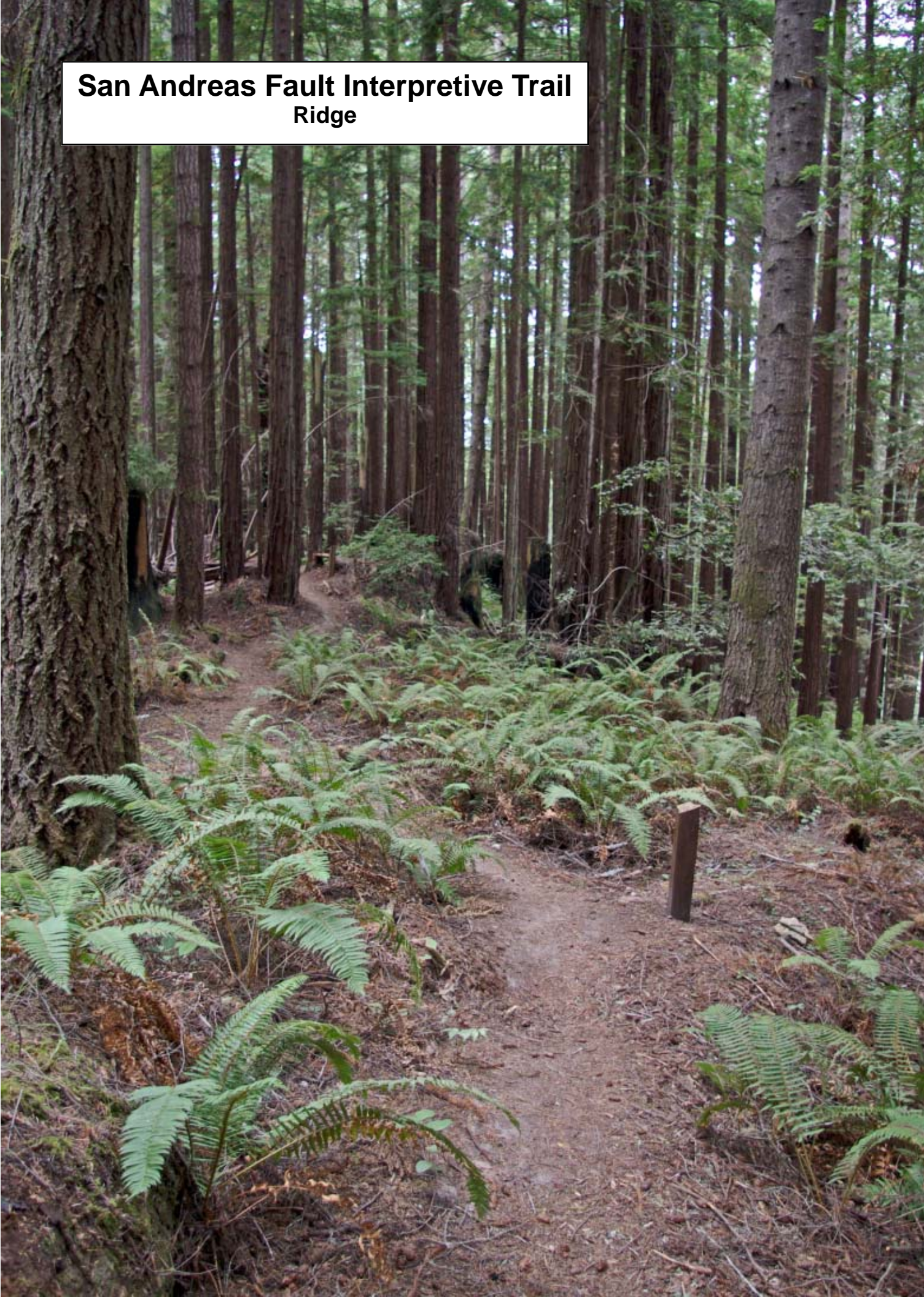
Photo: Looking northwest along trail

The first part of the trail follows along the top of a northwest-trending ridge. This is one of several ridges that have formed within the fault zone. Ridges like this are a common feature of faults like the San Andreas and are formed when the rocks in the fault zone are squeezed and/or uplifted by the faulting.